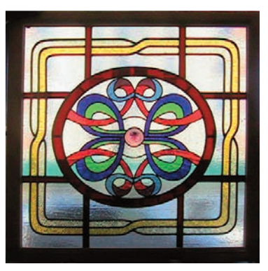
This Studio Show kicks off Patti Kelly's next project: building a self-contained meditation space / a full-sized stained glass healing room.